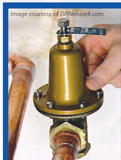
Pressure regulating valve installed

If you know how to perform minor plumbing repairs or if you have ever repaired a sprinkler irrigation line, you can probably install this device yourself. PWD recommends that you install the valve on the incoming service line to the house or building. If you are uncomfortable performing this task, PWD has local plumbing contractors that we can recommend.